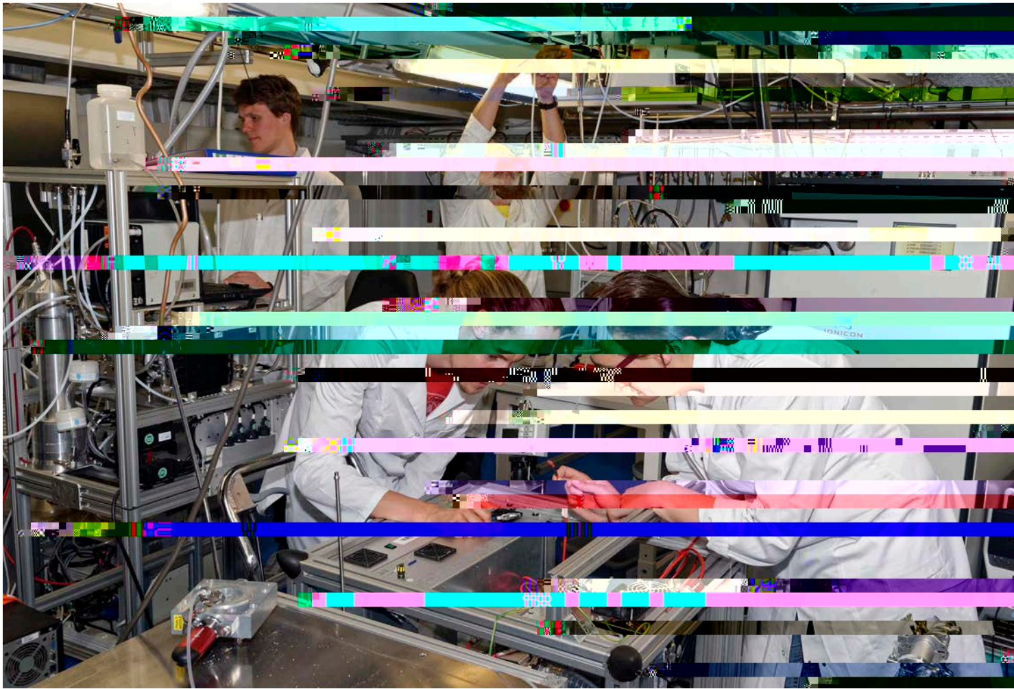
Scientists at the LEAK cloud chamber, Leibniz Institute for Tropospheric Research